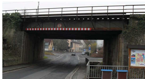
Figure 5: Winterhausen steel bridge

In Winterhausen a two track steel bridge was completely replaced by a concrete bridge with embedded rail on both sides: