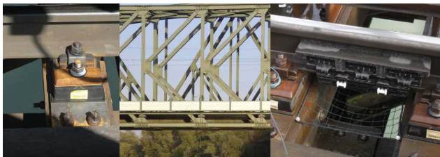
Figure 3: Highly elastic rail fastening (left), noise barrier (middle) and rail damper (right)

The installation of these measures was done at three different times of the year so that there was enough time to do measurements between each installation. The effect of each measure could be determined separately.