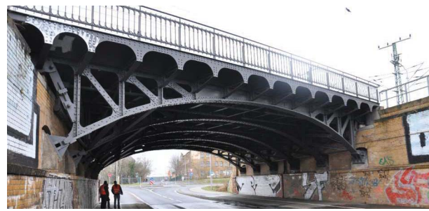
Figure 7: Steel bridge with ballasted track in Leipzig, Pittlerstraße