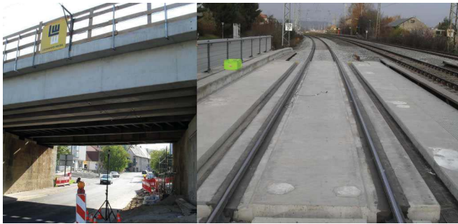
Figure 6: Concrete bridge with embedded rail

In one side of the bridge an additional noise barrier as railing was installed.