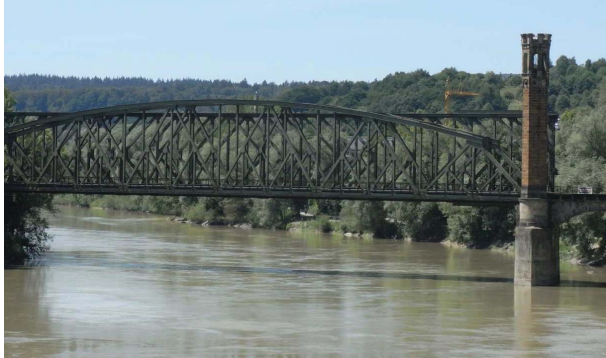
Figure 2: Passau Inn bridge

In 2010 the steel bridge over the river Inn in Passau was dampened. The rail on the bridge has been fastened on wooden sleepers that were directly placed on the steel construction of the bridge.